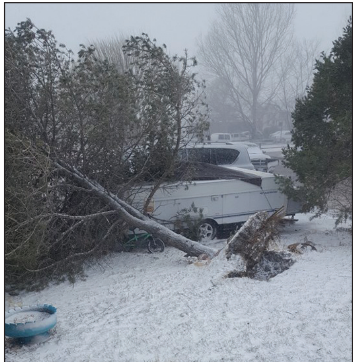
Susan Griswold shared this image of a tree that fell onto what appears to be a camping trailer. A record gust of 96 mph was recorded during the storm.