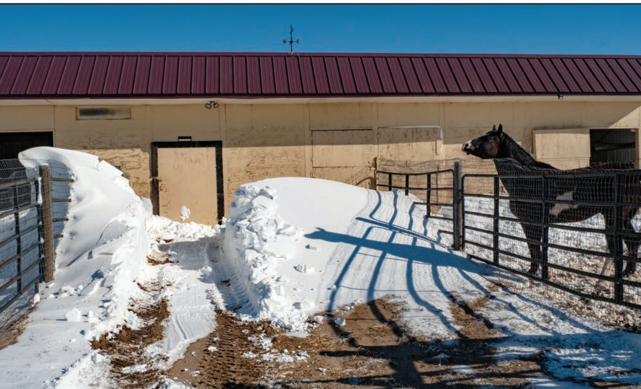
Paths had to be plowed in horse stalls due to high drifts blocking them, before horses could be let out of their barns to stretch their legs.